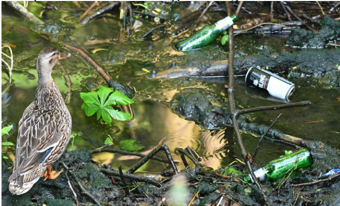
"Female Mallard By Water With Rubbish" by Martin Kessel

A huge problem with plastic is the chemicals it contains. Over time, pieces of plastic litter will break into smaller pieces. These smaller pieces are often eaten by wildlife that think that it's food. Scarily, these tiny pieces of plastic contain poisonous chemicals and heavy metals that can kill wildlife. The chemicals make their way into the food chain and do not just affect the creature who ate the plastic but also affect any animal that